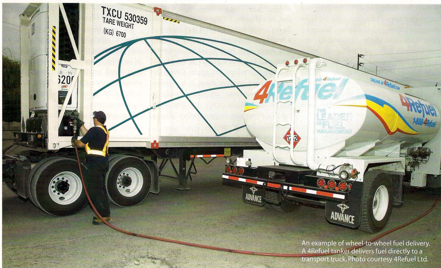
An example of wheel-to-wheel fuel delivery. A 4Refuel tanker delivers fuel directly to a transport truck.

Not all fuel theft is done by organized thugs. A more common situation is when fuel is pumped illegally by workers for their own private use. With the high cost of fuel, it is a growing problem, notes Lee. "In addition, spillage is also on the increase. The price of fuel has increased to where it can be the largest operating expense for many companies, so every litre of fuel that is not used for productivity affects the company's bottom line. Years ago it was no big deal for the boys to help themselves to some fuel. The occasional fill-up on the company was viewed as an employee perk