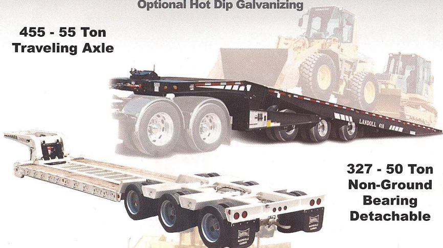
327 - 50 Ton Non-Ground Bearing Detachable