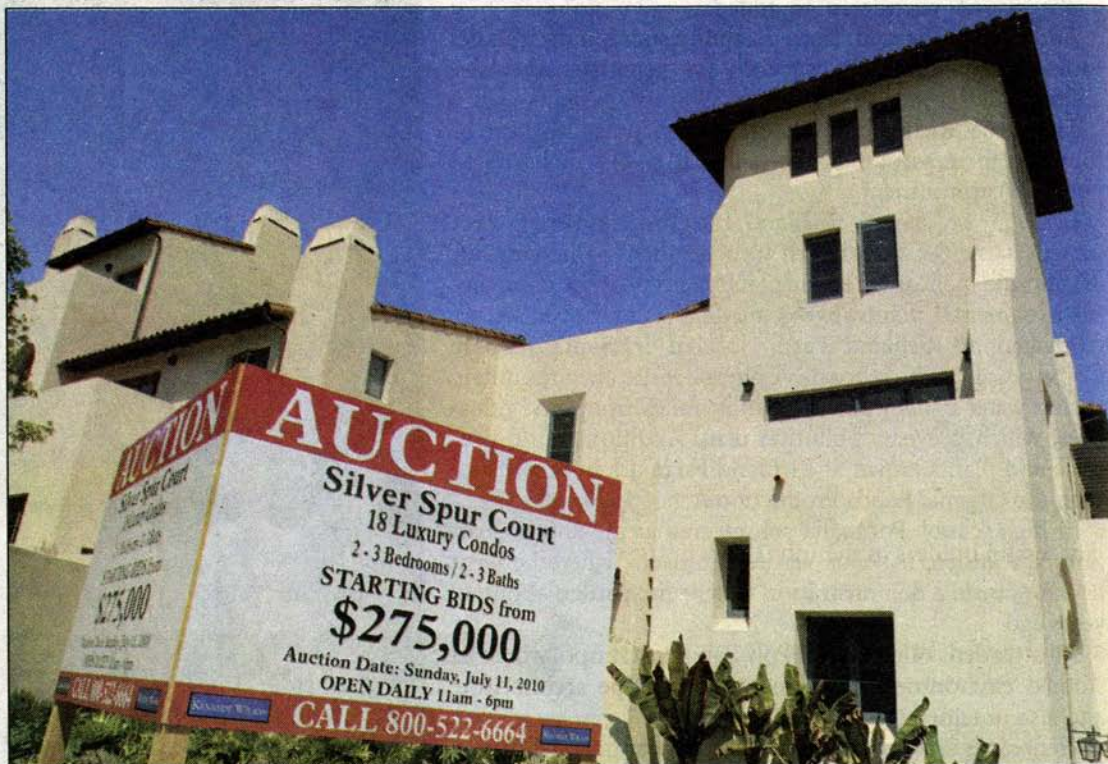
Tom Underhill, Peninsula News

Starting bids at Silver Spur Court range from $275,000 to $495,000 on 18 luxurious town-houses and flats previously priced from $835,000 to $1,275,000. The two- and three-bedroom homes include 2 1/2 baths and pro-