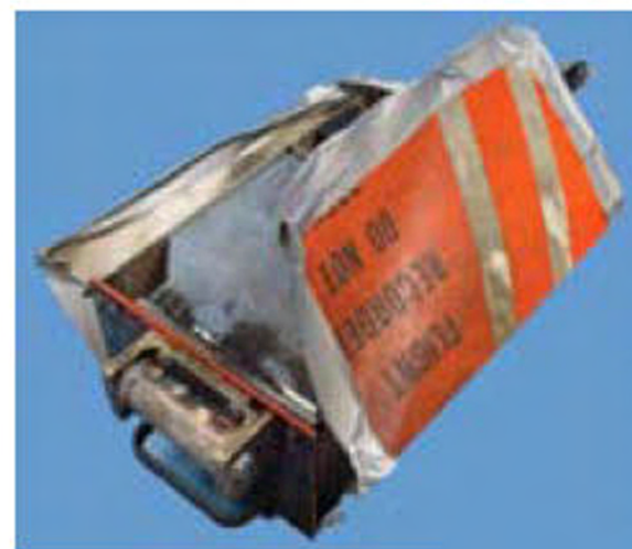
Photo 3 (left)—CVR from a plane that crashed, cut open to access its data

Star Navigation Systems Group Ltd. has recently announced its new Terrastar in-flight monitoring system. The company hopes to sell its system initially as an extra black box that will transmit the data that it collects during the actual airplane flight. Company leaders feel that their system can pick up flight anomalies and provide the information to the